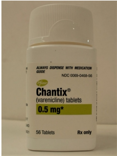
Chantix (varenicline) Tablets 0.5 mg Tablets