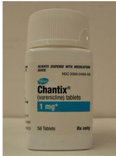
Chantix (varenicline) Tablets, 0.5/1 mg Tablets