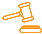
Government and Policy Makers