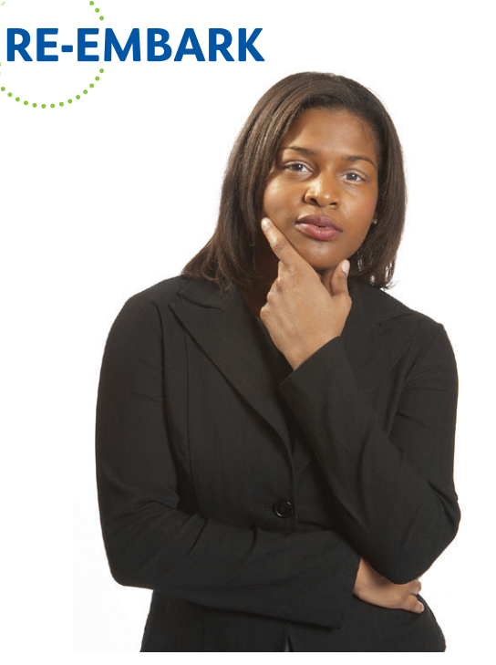
Consider participating in the RE-EMBARK Study Take the first step.

For more information or to see if you qualify for this study, please contact: