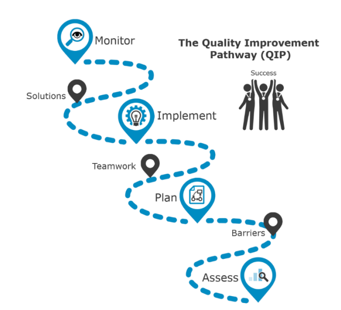
Figure 2. The Quality Improvement Pathway

FQHC participants will be guided through a quality improvement (QI) pathway on this project, as illustrated in Figure 2 . Qsource will assist with an initial practice assessment to determine how practices are currently capturing pneumococcal immunization data and reviewing current workflows, orders or clinical decision support rules for adult immunizations. Qsource will assist the practice with monitoring current pneumococcal immunization rates to determine which interventions will be most effective.