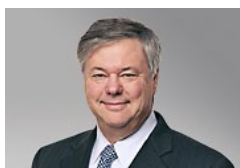
Michael S. Brown, M.D. (4, 6) Distinguished Chair, Biomedical Sciences, Regental Professor, University of Texas Southwestern Medical Center. Will retire as a Board Member effective as of the 2012 Annual Meeting.