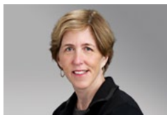
Helen H. Hobbs, M.D. (4, 6) Investigator, Howard Hughes Medical Institute