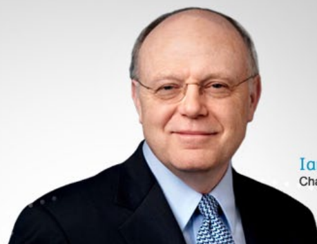
Ian C. Read Chairman and CEO