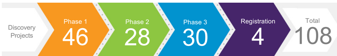
Pfizer Pipeline Snapshot as of October 29, 2024

Pfizer announced positive topline results from its pivotal Phase 3 CREST trial evaluating sasanlimab, an investigational anti-PD-1 monoclonal antibody (mAb), in combination with Bacillus Calmette-Guérin (BCG) as induction therapy with or without maintenance in patients with BCG-naïve, high-risk non-muscle invasive bladder cancer (NMIBC). The study met its primary endpoint of event-free survival (EFS) by investigator assessment, demonstrating a clinically meaningful and statistically significant improvement with sasanlimab in combination with BCG (induction and maintenance) as compared to BCG alone (induction and maintenance).