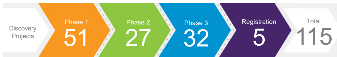
Pfizer Pipeline Snapshot as of February 4, 2025

Pipeline represents progress of R&D programs as of February 4, 2025