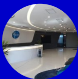
Dalian, China APAC